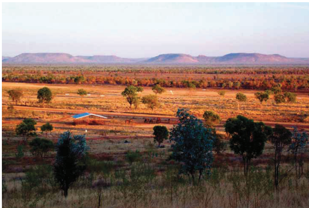
Conditions at Victoria River Research Station (VRRS), formerly Kidman Springs, are typical of much of the NT pastoral zone. DDRS breeders are outperforming the breeders in the Department's commercial herd.