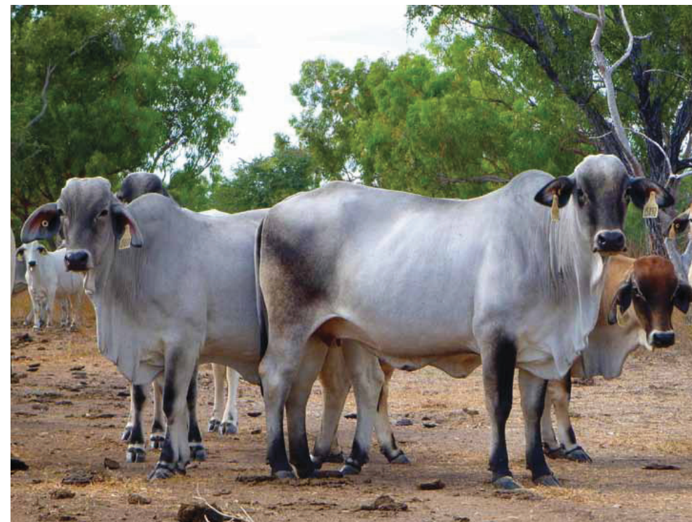
Yearling mating of heifers favours smaller framed females that reach puberty early. As cows they find it easier to maintain condition and to get back in calf within the 12 month cycle.

Similarly, the effect on scrotal size EBV was also immediate when selection pressure was applied to