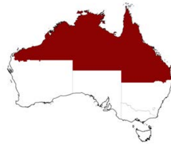
The geographical scope of the FutureBeef Program for Northern Australia.

The FutureBeef initiative for beef extension aims to bring the latest research technologies and best management practice knowledge, skills and training into the hands of northern beef producers.