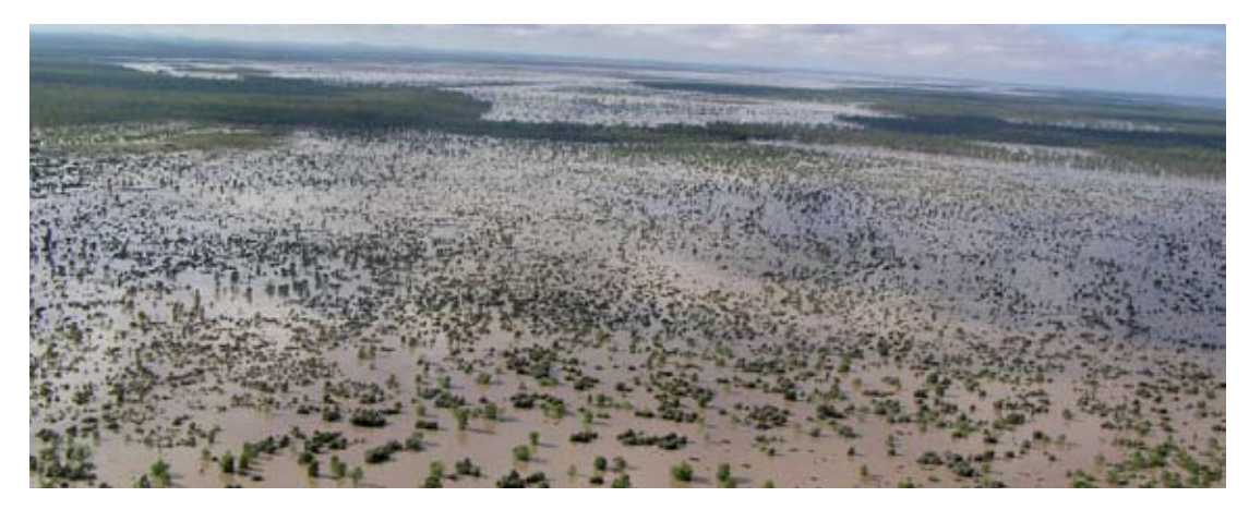
Belyando River in flood, January 2008

Brett Kinnon is happy to discuss his experiences with flood damaged pastures. He can be contacted on 4983 5391.