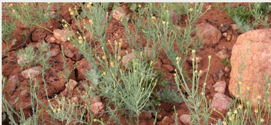
Pimelea simplex in Quilpie area.

The effects of pimelea poisoning are not always predictable. While affected cattle can experience gastro irritation and diarrhoea, the full blown St George disease shows up as swellings, usually under the brisket, belly and jaw.