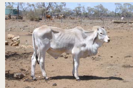
Animal showing clinical signs of St George disease.

More information on phosphorus management and diagnosis is on the FutureBeef website ( futurebeef.com.au/knowledge-centre/nutrition ) or contact your local DAF FutureBeef extension officer.