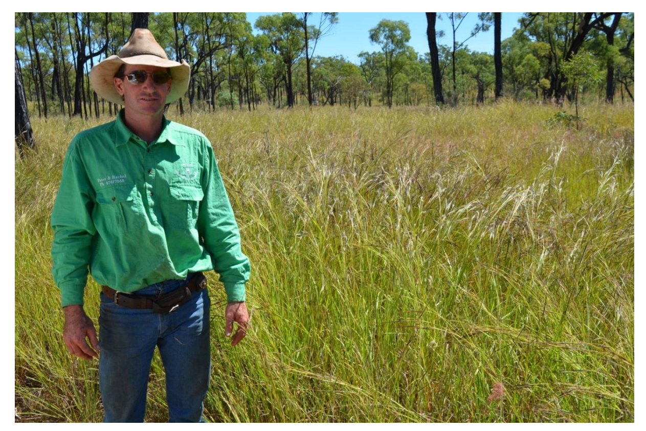
Image 3. Spelling for five months over the 2011–2012 wet season revitalised the speargrass pastures.

Infrastructure development on Oakleigh–Fernhills includes the 15 main and five smaller holding paddocks, 23 dams, four troughs and two sets of yards. Generally land condition is in A to B condition across the main paddocks, indicating a minimal reduction in productivity (≥ 75% of original carrying capacity). Pastures are generally dominated by 3P (productive, palatable and perennial) grasses with some Seca and Verano. The presence of Kangaroo, Blue grasses and Giant speargrass in most paddocks reflects a history of conservative stocking rates. Key land types include frontage soils, old alluvials, ironbark, Goldfield soils, poorer granites, lancewood and range country (Table 1).