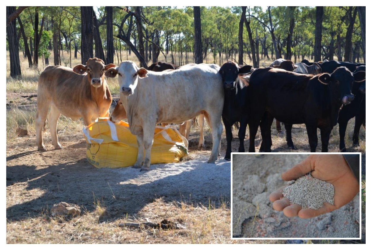
Image 10. Heifers on Oakleigh–Fernhills receive wet season phosphorus via bulk bags (10% P as fed).