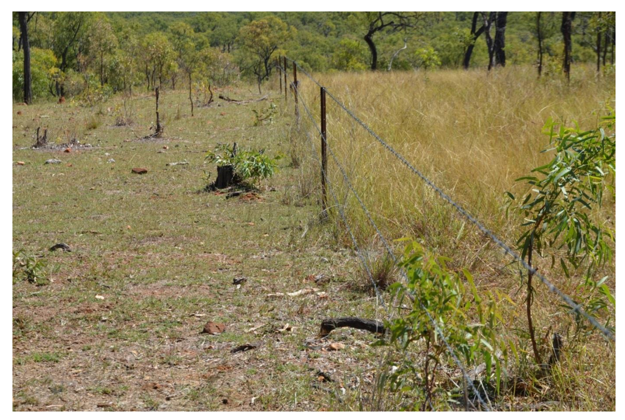
Image 4. Grazed Faraway paddock on left and spelled Peggy's paddock on right. Peggy's paddock had been spelled for four months over the wet.

Currant bush and Eucalypt species (Image 5) are resistant to fire, and steady thickening of these species significantly reduces annual pasture growth across many land types. With the exception of wildfire, burning is not commonly used on Oakleigh–Fernhills.