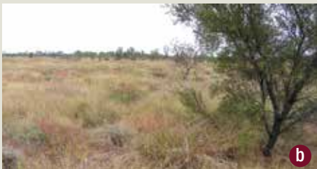
Figure 1: a) shows the Einasleigh town common at the beginning of the research in 2008, largely in C/D condition. b) shows the Einasleigh site in 2011 after 3 wet season spells now in majority A/B condition.

the type of wet season each year. It is also important to avoid overstocking the recovering pastures during the following dry season. Retaining good ground cover and stubble for the break of season storms will reduce runoff and dramatically improve grass growth.