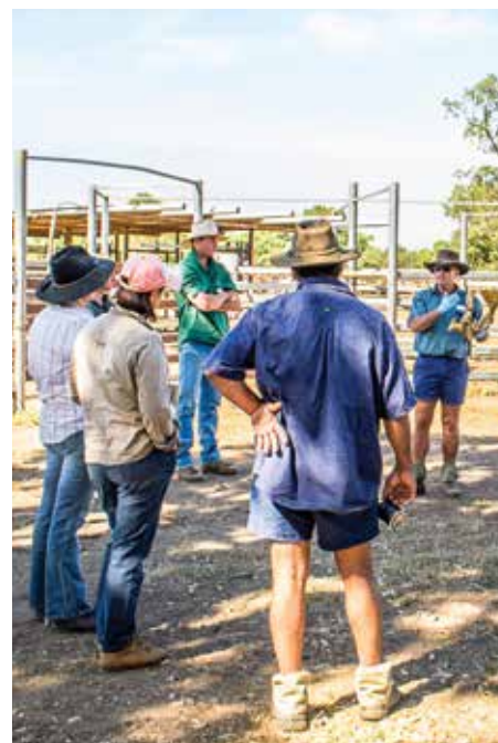
Rocky Springs Breeder Management workshop participants.