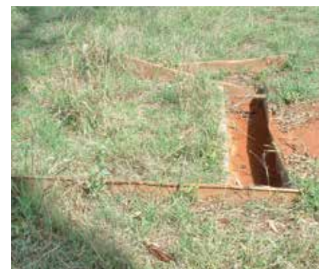
Image 1 – Site 1: Sediment trap in improved pasture paddock with over 90% ground cover.