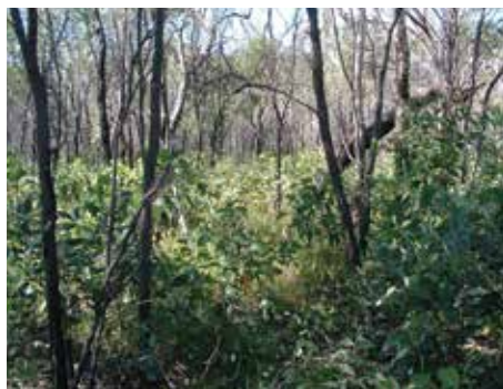
Image 4 – Showing the timber thickening problem that seriously reduces grass production.