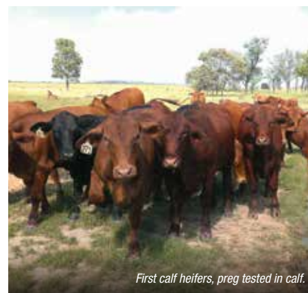
First calf heifers, preg tested in calf.