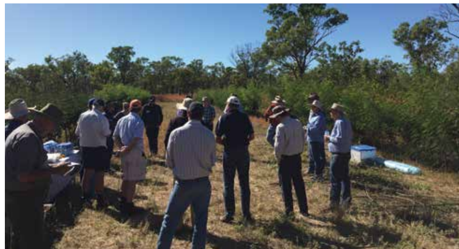
Conference goers inspect the new 'Redlands' variety of Leucaena at Whitewater Station.

A field trip followed the conference, visiting Whitewater Station, to enable delegates to review the MLA/UQ palatability trials and the local legume and grass trials conducted by DAF.