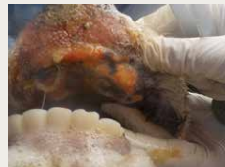
Mouth lesions of a FMD affected cow.