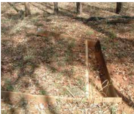
Image 2 – Site 2: Sediment trap nearby in the thickly timbered country with mostly unattached dead leaves as ground cover measured at 60%.