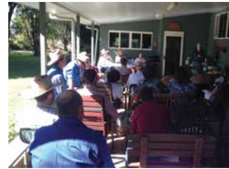
At a recent Dalrymple Landcare Group meeting near Charters Towers members discussed feral chital deer management. This knowledge and expertise would be welcome at the Pest Animal Symposium, Townsville, 7-10 November 2016.

'The organising committee would like to thank our sponsors: Townsville City Council, NQ Dry Tropics, Animal Control Technologies Australia, FNQROC and technical contributor Department of Agriculture and Fisheries, as their support makes it possible to hold these events in regional Queensland.'