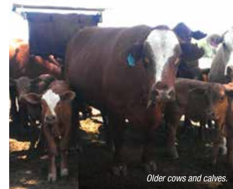
Older cows and calves.

Seasonal nutritional deficiencies are the largest limitation to beef production in Northern Australia.