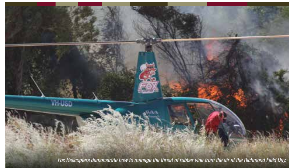
Fox Helicopters demonstrate how to manage the threat of rubber vine from the air at the Richmond Field Day.

A Weed Control Innovation Forum and Field Day was held in Richmond on Wednesday 27 April 2016.