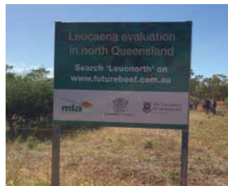
Signage about the Leucaena trial on Whitewater station.

Mount Surprise producers are also hosting a MLA-funded Producer Demonstration Site (PDS) that is investigating and evaluating Leucaena plantings under established timber on Whitewater Station.