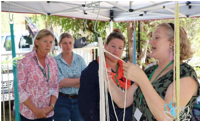
Craft sessions require the women's upmost concentration.

In 2020, the Basalt Bash is heading to a new location, Mt Carbine. This will see the event welcome a new wave of ladies from Cape York Peninsula. 'Bloom & Prosper' will offer a networking event followed by workshops that are themed around disaster recovery . The GrazingFutures team (Southern Gulf NRM & DAF) in Cloncurry and Richmond are eager to mirror this successful model to engage rural women across north west Queensland.