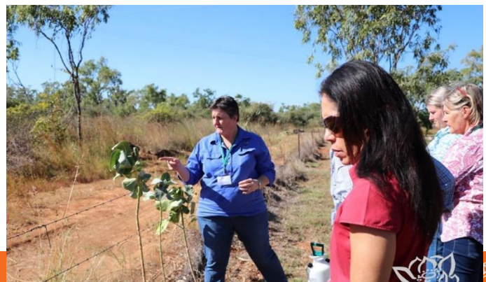
The ladies love getting involved in practical activities