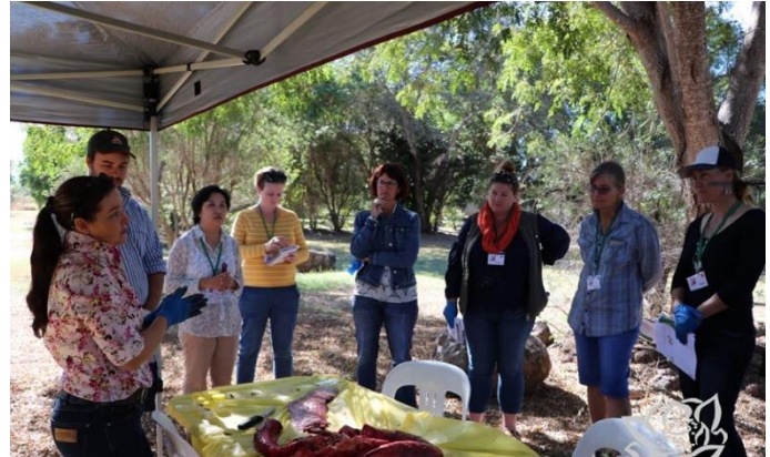
Information sessions on agricultural topics