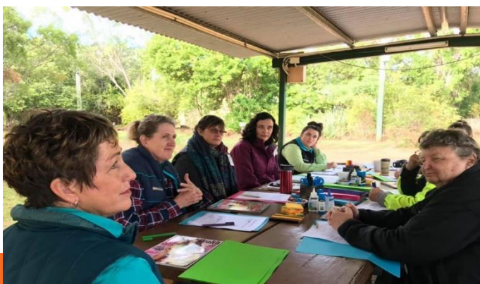
Small groups provide a safe place to share.