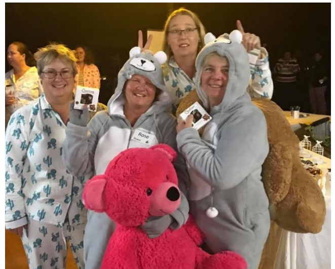
Networking & making connections are a necessity

At earlier events, the total number of participants was around 25. However, over the years this number has skyrocketed, with recent years seeing as many as 70 women converge on the Basalt Bash for a few days of fun, learning and abit mischief.