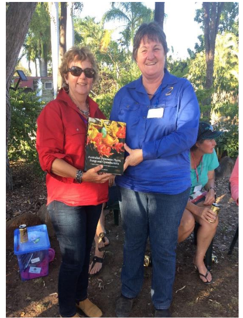
Weed Management is always a favourite!

“This is a great event to empower ladies with more confidence to make their businesses better. Networking & connections are really important for bush women.”