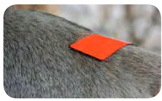
Figure 2: Estrotect heat detection aid. 100% rubbed indicates this heifer has been on heat.