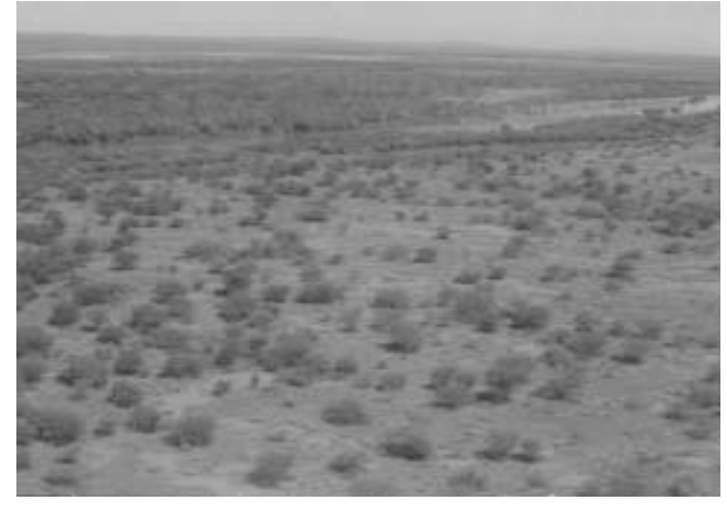
Infestation Mature Plant