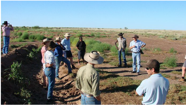
Kimberley pastoralists gathered at Larrawa Station for a field day to learn more about ponding. (Matt Brann)

If you've got patches of hard, bare, scalded country on your station... then waterponding might be the answer.