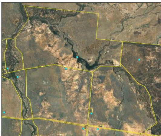
Example of a property map showing paddocks and water points

Places are strictly limited. RSVP by 8 Nov 2017.