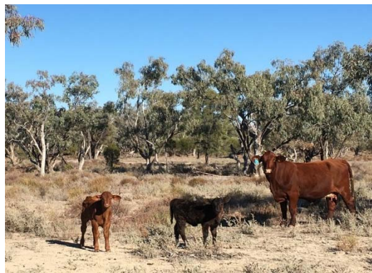
Image 3 – Cow and calves in one of the paddocks that was sampled for NIRS and P testing

The interpretation of these results suggested that in all paddocks P% was extremely low at 0.11-0.13%. It should be around 0.21 for dry cows and 0.28 for heavily pregnant or lactating cows. These low levels were probably limiting the ability of the cattle to have pasture intake sufficient to meet their nutritional requirements. The results also reflected a high diet quality due to the 100% herbage content (dried non-grass component). The ash % can be a reflection of how close to the ground stock are grazing, for example, if the non-grass component was coming from mulga, the ash % would be very low as they would not be consuming much soil when they graze.