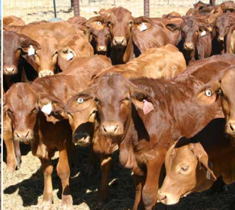
Weaner production = (calves weaned/retained cows) x average calf weaning weight