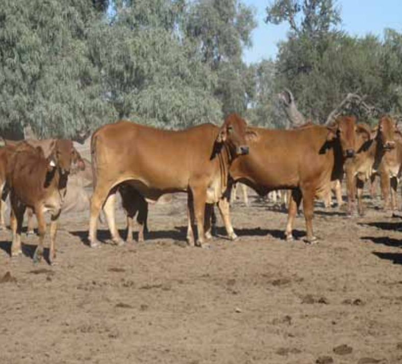
Cow performance is greatly influenced by body condition at calving.