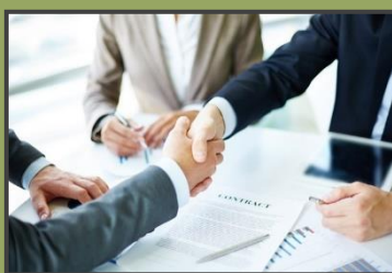
PEOPLE AND BUSINESS