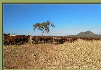
GRAZING LAND MANAGEMENT