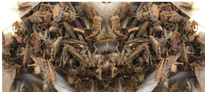
Figure 8: Grasshopper species captured using a net

Economic impact estimates from producers came in many different forms and the GrazingFutures team members will be working with economists and other specialists to calculate monetary figures. A quarter of producers provided an economic impact estimate to their business. Initial figures indicate that average economic impact equates to approximately $300,000 per business; these figures varying from $24,000 to $1,000,000 in losses. With only a quarter of producers providing a figure and there being such variation in this figure it is hard to provide an accurate value of economic impact until further analysis is done.