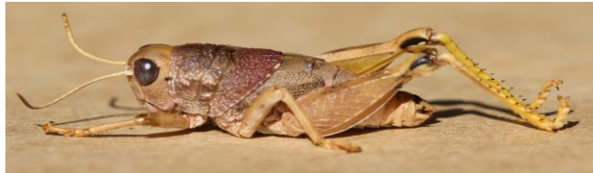
Figure 10: Lagoonia sp.1

Predicting desirable conditions for hatching and thriving of grasshopper populations could assist in more timely management decisions. Through the survey, project officers have been able to obtain some insights of desirable hatching and living conditions for these grasshoppers in the region.