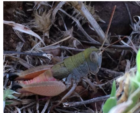
Figure 9: Grasshopper nymph of the Peakesiina subtribe