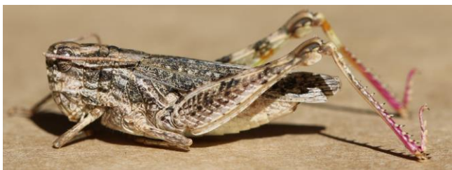
Figure 10: Yrrhapta sp.

Anecdotal evidence and discussions with producers indicated that a cold snap in May