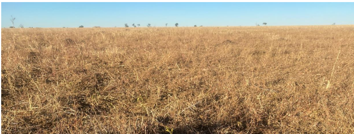
Figure 11: Previously productive pasture stripped by grasshoppers