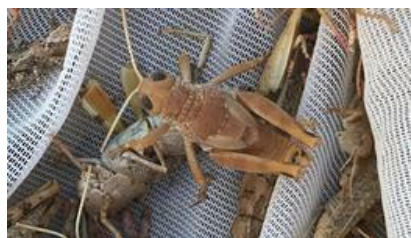
Figure 2: Lagoonia sp.