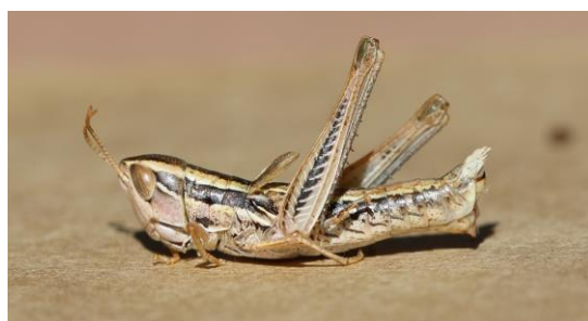
Figure 7: Genus 64. sp.1