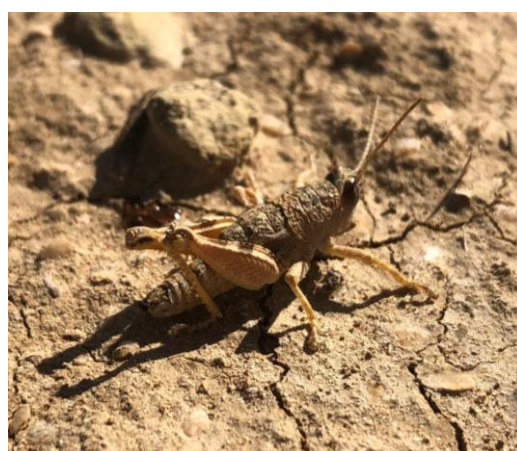
Figure 6: Grasshopper east of Longreach

Producers could not plan or budget for the level of impacts experienced. With large reports of destruction to pasture plants resulting in degradation of pasture condition, many producers have had to re-evaluate their position going forward. This caused significant interruptions to management practices and had severe impact on potential cash flow.