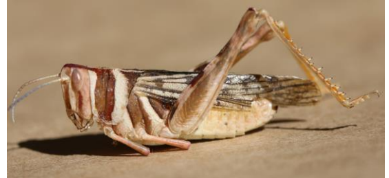
Figure 7: Stropis sp. (leopard grasshopper) adult

“Loss of approx. $200,000 due to having to sell stock sooner than budgeted. Current stock numbers are at their lowest in the 47 years of operation of this business.” —Producer north-east Winton.