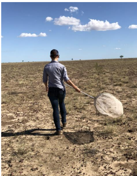
Figure 4: Catching grasshoppers north of Longreach in March 2020

Concern from producers spiked interest from GrazingFutures project officers to investigate the grasshopper invasions further and collect comparative data for Western Queensland. A survey provided to producers was commenced as a data collection initiative and as a way to support these producers by ensuring their concerns were heard. It also allowed the GrazingFutures team to capture valuable and far-reaching observations and to identify the severity of impacts to grazing businesses. It aimed to highlight key issues such as: