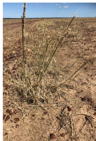
Figure 1: Stripped and detached Mitchell grass seed heads

The survey was initiated in an endeavour to gain a better understanding of grasshopper population dynamics, to observe trends over time and to capture pasture destruction and levels of economic impact. These estimates will better position GrazingFutures project officers in supporting potential future funding opportunities and research submissions.