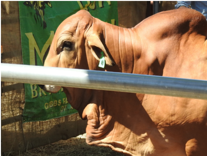
A lump on the side of the neck is usually indicative that the animal has been vaccinated.

If the bull wasn't vaccinated at the time of sale, it's recommended to vaccinate prior to joining. The vaccine does leave a lump on the side of the neck but this is good confirmation the bull has been vaccinated.