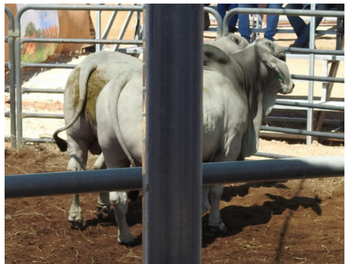
Grainfed bulls will often be in very good condition and exhibit very soft loose faeces. These animals will take time to adjust to poorer quality pastures.