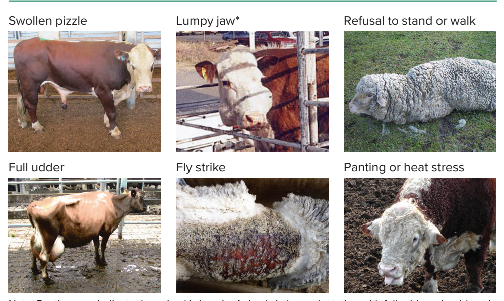
Note: Panting may indicate the animal is in pain. Animals in heavy lactation with full udders should not be transported.