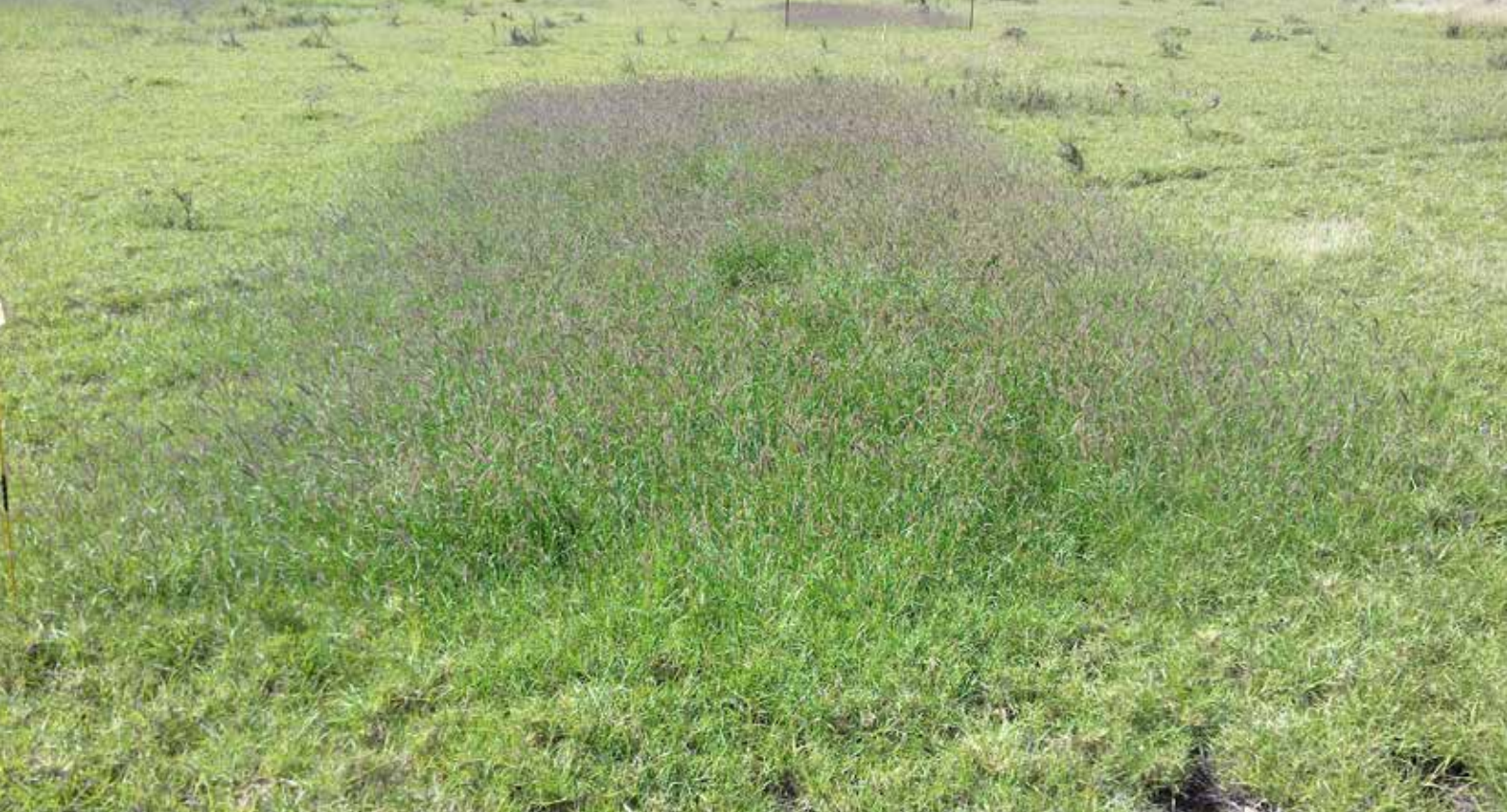
Figure 2: Response to N fertiliser on run-down buffel grass—in this case, the fertiliser used was Green Urea, broadcast on the surface