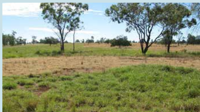
Figure 5: Sprayed-out strips

In situations where a cultivated seedbed is not achievable, spray existing pastures before planting legumes to reduce competition (preferably a couple of times) and assist with moisture storage (Figure 5).