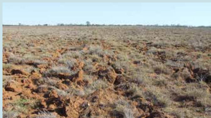
Figure 4: Poor seedbed

If the number of better grasses in the paddock are low, the whole paddock should be prepared. Hard-setting soils should be lightly cultivated or ‘roughened up’ to promote water infiltration and allow seed to be planted on top or just under the soil surface. Avoid very rough seedbeds with large clods, as seeds can be planted too deep (Figure 4).