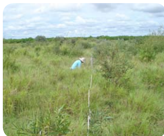
Yarandoo buffel grass with regrowth