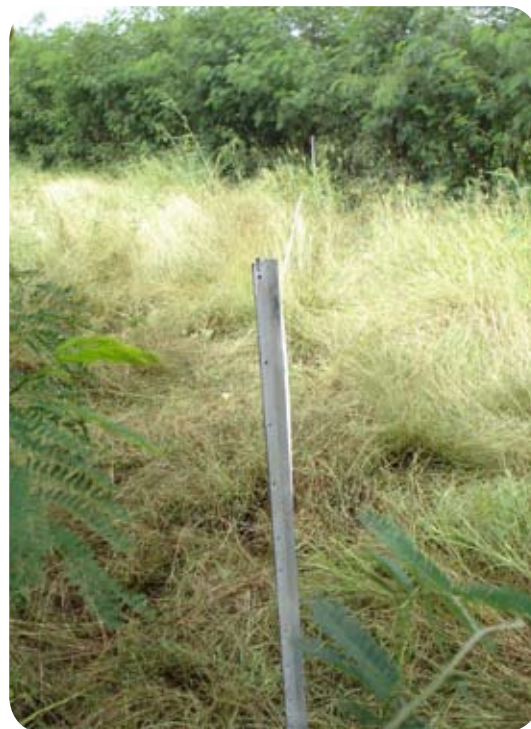
Yarandoo 10 year-old leucaena established on previous cultivation