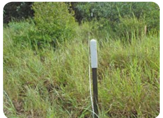
Clarkwood regrowth with buffel pasture