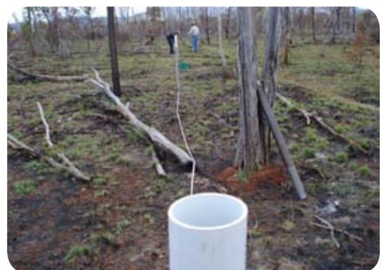
Burnt and unburnt ironbark forest country