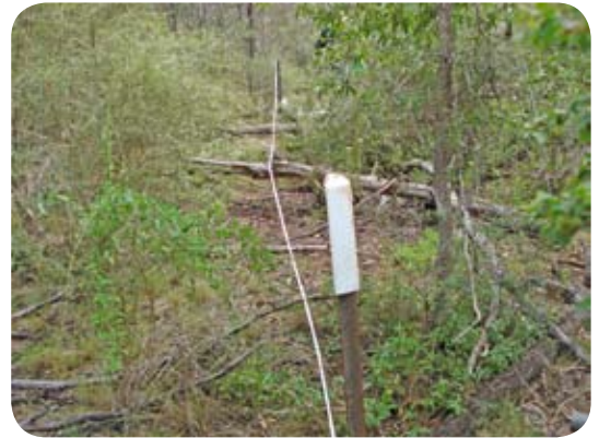
Clarkwood remnant brigalow softwood scrub

The stick-raked country had 7034 kg/ha pasture biomass in March 2011 at the end of the growing season before any grazing had taken place. Eight months later in November 2011 after two grazing periods, pasture biomass was 3665 kg/ha. The regrowth site had 3566 kg/ha pasture biomass in March 2011 and 2881 kg/ha in November 2011 under the same grazing regime. These results indicate that much more pasture was