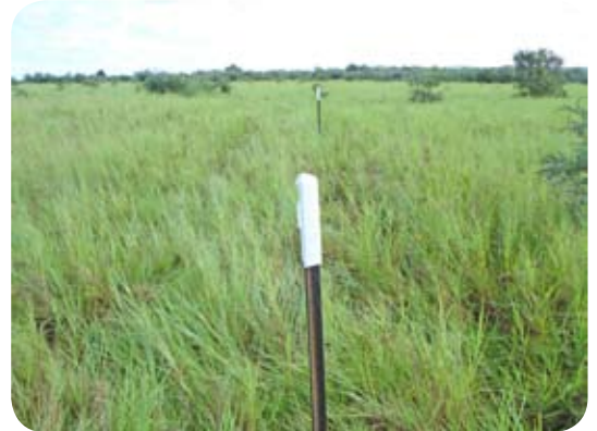
Clarkwood cleared and stick-raked buffel pasture